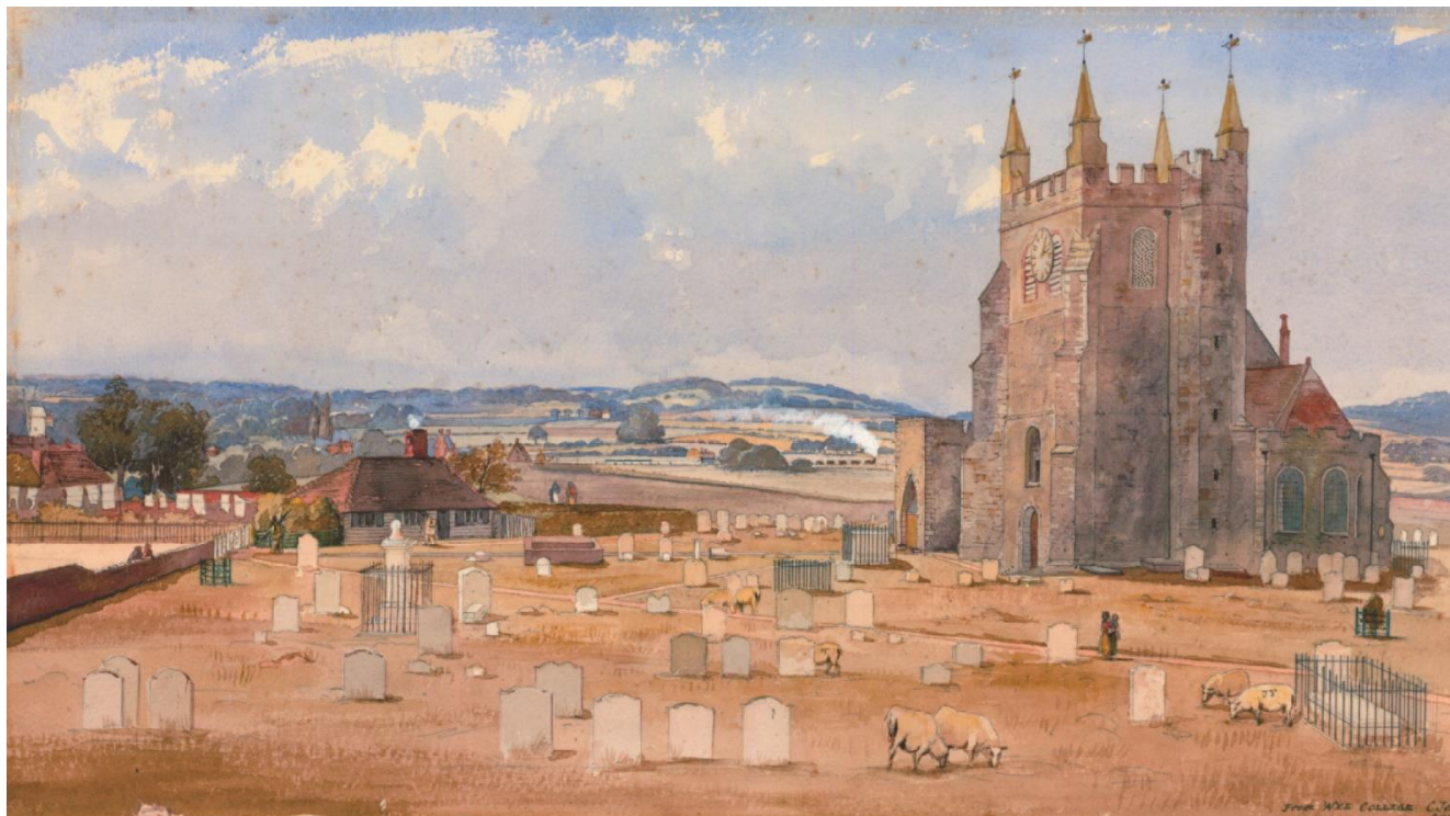
The Church of St. Gregory and St Martin, Wye

best-known watercolour, dated 1857, is a view across the churchyard from the East, showing a train and was painted twenty years before the landscape that resembles Mike's oil painting, which also features a train. Wye Church own this early painting and two others of the church: one shows the round-headed west window and another, painted three years before his death, shows the later Victorian window installed in 1878.